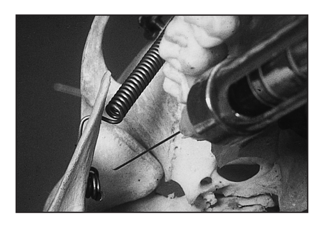
Fig. 1a and 1b The position of the needle during a Gow-Gates 'high' block of the inferior alveolar nerve

The Gow-Gates and Akinosi techniques are both 'high' methods of blocking the inferior alveolar nerve; both anaesthetise the lingual nerve. In addition the Gow-Gates method will block conduction in